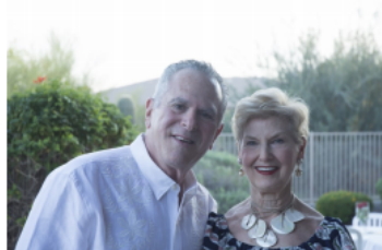
Can you describe how Villages of the Berkshires works?

Villages is not a group of buildings; it is "neighbors helping neighbors" so that members can enjoy life in their homes safely, successfully and affordably. Members have access to information, volunteer services and social opportunities that contribute to a healthy, vibrant and meaningful life. Volunteers provide everything from transportation, to friendly check-in calls, to reading aloud, to minor household repairs and technology assistance. Villages is funded by membership fees, donations and grants.